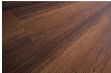
7172 American Walnut