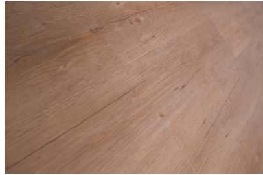
3902 Pine Natural Light