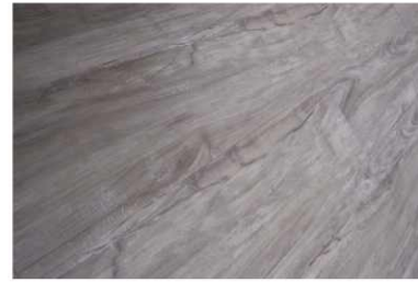
00321 Chalky Grey