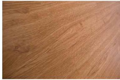
00102 Oak Classic