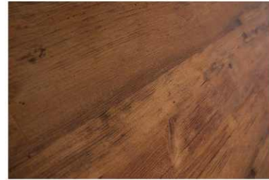
6002 Pine Rustic Brown