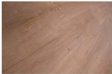
3902 Pine Natural