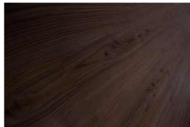
63937 Western Grey