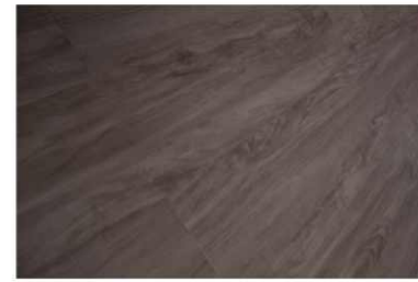
00326 Dove Grey