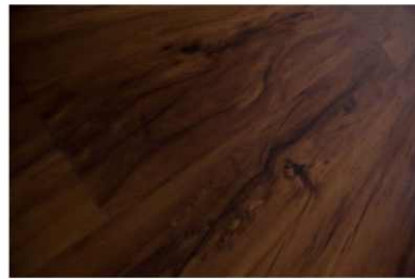
00275 Handscraped Dark Brown