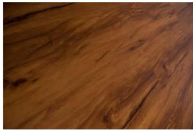
00271 Handscraped Light Brown